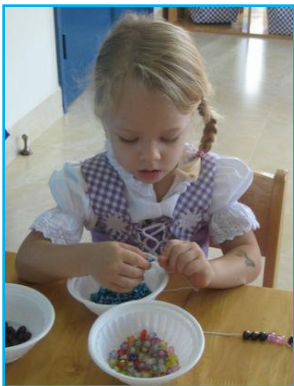
Threading a bracelet.

Street 10. It was so much fun to see what our friends were wearing! Then we ate our very own feast of food from around the world! We were all very proud of what we shared! We continued learning about our countries individually through different activities.