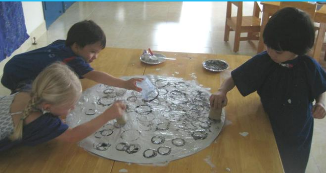
We had fun stamping craters on the moon!