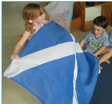
"That's where I'm from!"