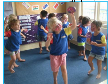
We loved dancing to salsa with our rice shakers!