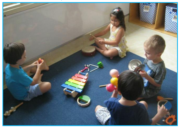
Blue Group Jam Session