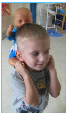
"I'm taking care of my baby."